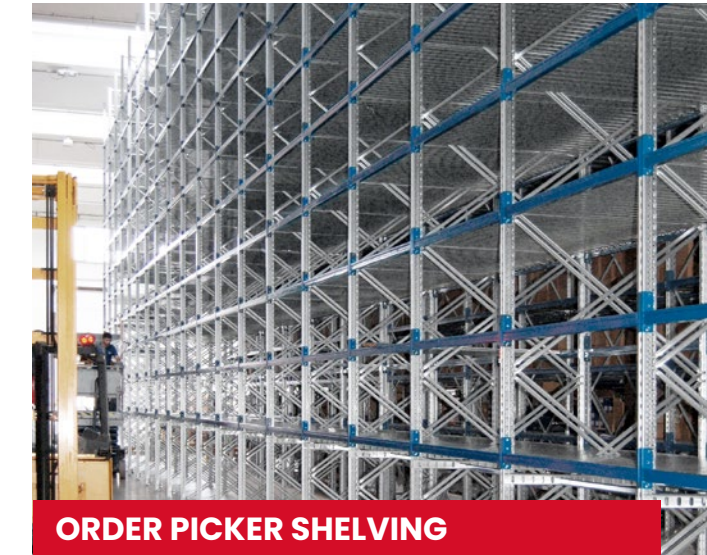
ORDER PICKER SHELVING

Ideal for the design of seismic-resistant systems , even at great heights, they can be served by order pickers and configured as multi-level or mobile shelving.