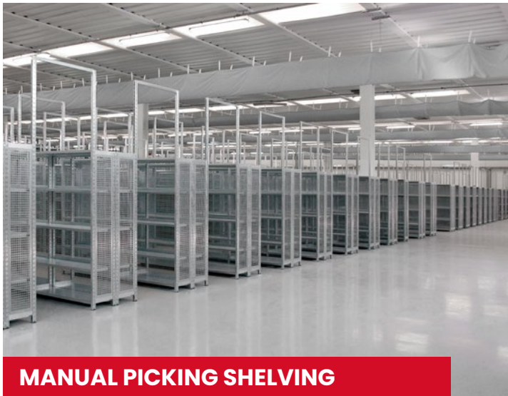
MANUAL PICKING SHELVING

ETERMET shelving systems are versatile and configurable solutions for picking and storage of medium-light loads .