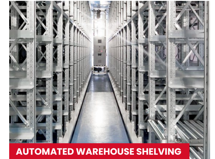
AUTOMATED WAREHOUSE SHELVING

Ideal for storing boxes, packages and loose goods , they offer flexible configurations thanks to the use of shelves and beams, together with a wide range of accessories for efficient product organizations.